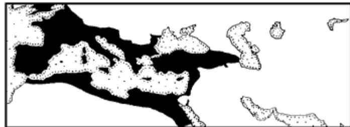
Feet of Iron and Clay